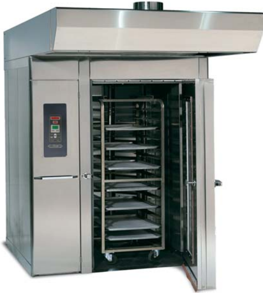
Model LRO-2 Shown (Rack not included)