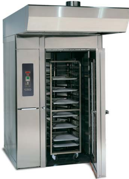
Model LRO-1 Shown (Rack not included)